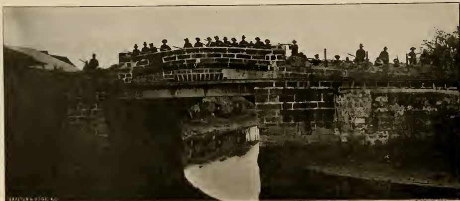
BRIDGE FROM WHICH THE FIRST SHOT OF THE PHILIPPINE WAR WAS FIRED.